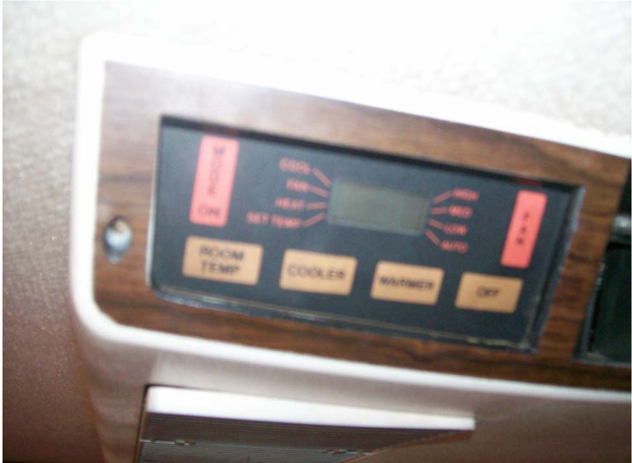
Above and below are from 610015.001